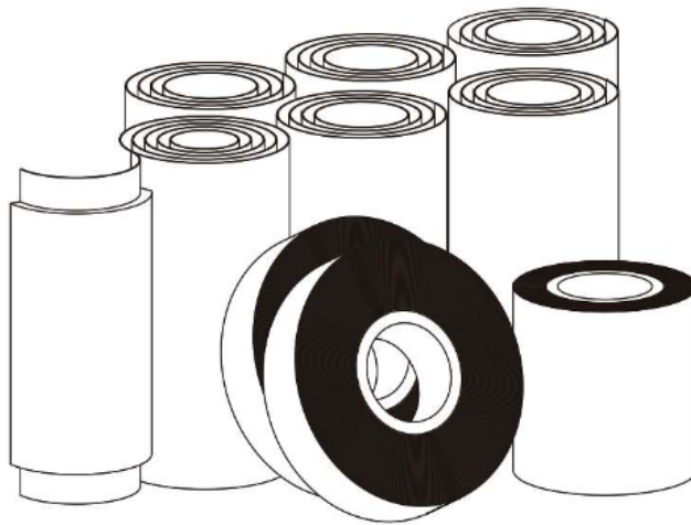
WS-KU Universal Weather Sealing Kit